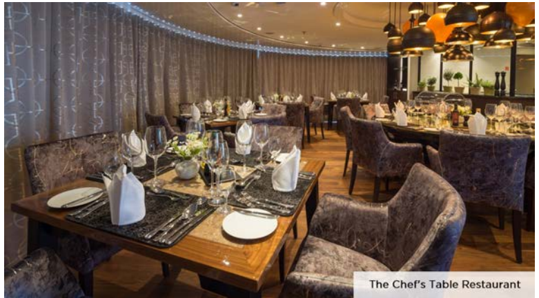
The Chef's Table Restaurant