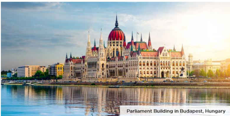
Parliament Building in Budapest, Hungary